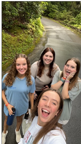
A stroll along one of the many beautiful trails at Montreat.

In June, Youth Group members enjoyed a fabulous week at Montreat!