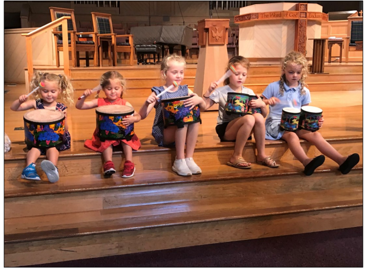
Drums are just one of the many instruments children have the opportunity to explore during FPC Kids Wednesday program.