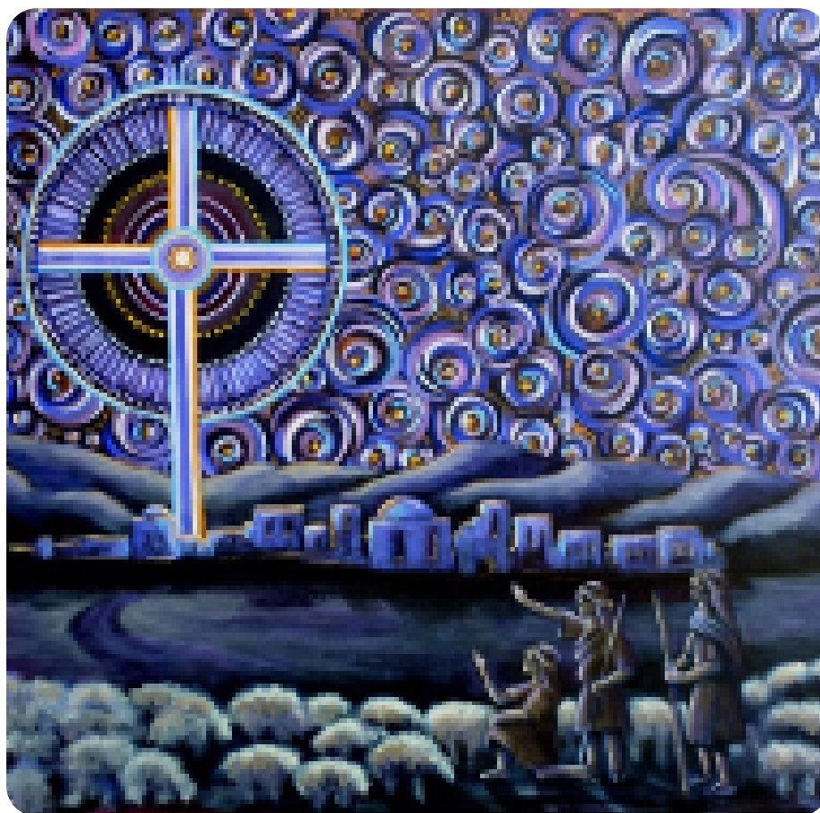
"Star of Wonder 2" by Virginia Wieringa, 2014 (used by permission)

EPIPHANY SUNDAY JANUARY 4, 2026 10:00 AM WORSHIP