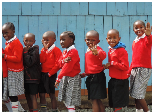
Impacting people around the world, your giving helps children in Africa and many other countries!

As you read the list of local and global programs that receive support from your pledge, imagine how your giving transforms lives near and far. FPC's Outreach Ministry plans to explore new partnerships in 2023 and will be open to whatever God may place on our hearts. Please pray for the missions we fund and the members of our ministry teams. And, as you pray, we ask that you reflect on how God may be calling you to grow in faith and generosity to glorify Him .