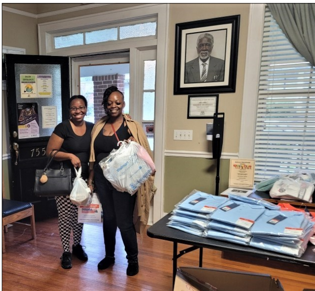
Parents at Antioch Education Center pick up school uniforms donated thanks to your gifts!