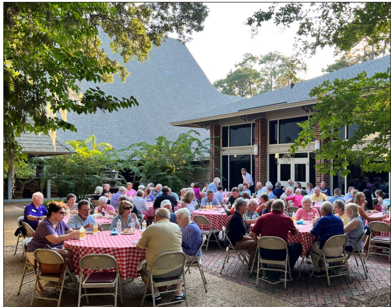
Right: More than 130 people attended the Lowcountry Boil

Adventures in Music (AiM) Choir To Sing in 10:30 AM Worship on October 9!