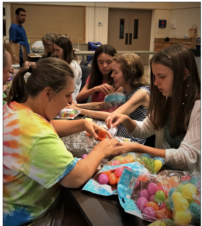
FPC youth often partner on projects with participants from Pockets Full of Sunshine.